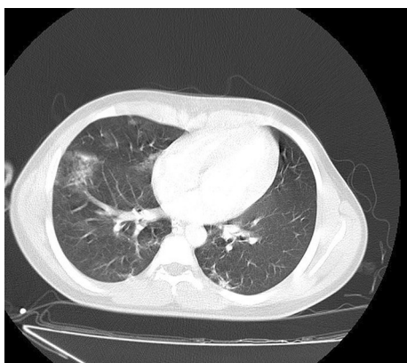
Fig. 1 Patchy ground-glass opacities in both lungs, especially in the right lung, propounded by COVID-19 infection. Heart size is normal. Pleural effusion is not seen. Chest wall is normal

hemorrhage, encephalopathy, encephalitis, meningitis, seizure, cerebral vein thrombosis, and Guillain–Barre syndrome [3]. Intracranial hemorrhage (ICH) is an uncommon situation due to COVID-19. This may happen because of some risk factors such as arterial hypertension or anticoagulant therapy [2]. Expression of angiotensin-converting enzyme 2 (ACE2) in glial cells and neurons may be a possible etiology for the neurological manifestation of COVID-19 [4]. In this case study, we will report bilateral basal ganglia hemorrhage in a 14-year-old boy who tested positive for COVID-19 and denied any past medical history or anticoagulant consumption.